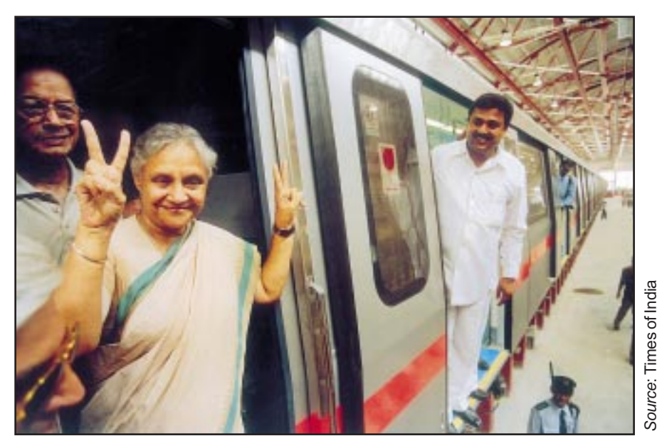
Chief Minister Mrs Shiela Dikshit in a metro coach made of stainless steel 301L at the DMRC's Shastri Park maintenance shed in New Delhi.

At elevated temperatures, stainless steel retains high mechanical characteristics. From a practical point of view at 500 °C, a stainless steel car body retains an important part of its stiffness; this is a guarantee of optimum resistance to the collapse of structures. This gives valuable time for evacuation of passengers in case of fire. Since nickel-containing stainless steels do not need painting, the threat of noxious fumes is minimized.